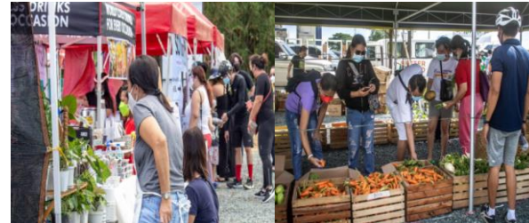
CABUYAO LAGUNA CIRCOLO MARKET