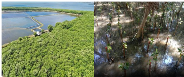
PAOMBONG BULACAN MANGROVE PLANTATION