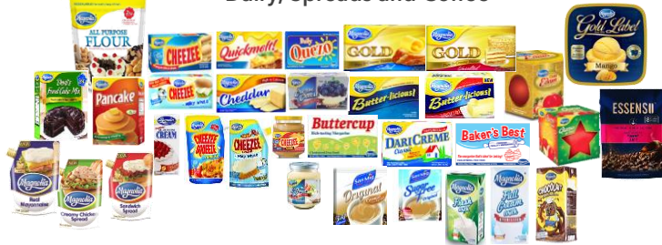
Dairy, Spreads and Coffee