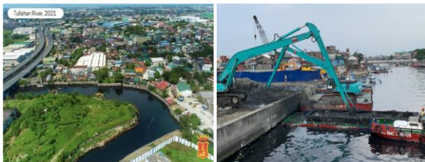
PASIG RIVER AND TULLAHAN RIVER CLEANUP